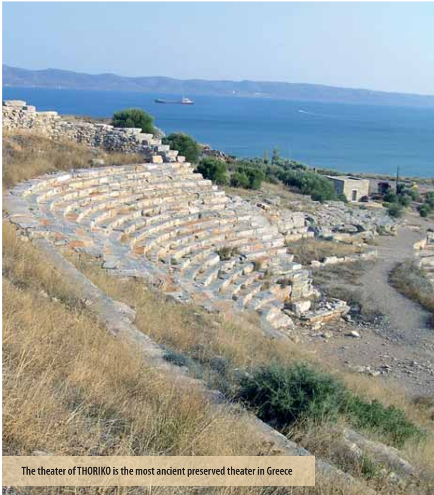
The theater of THORIKO is the most ancient preserved theater in Greece